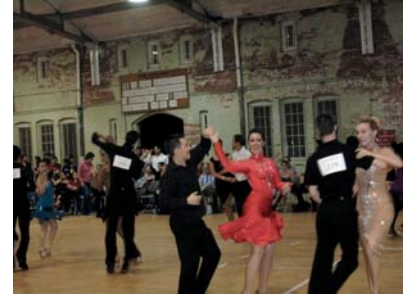
Participants show their stuff at the 19 th Annual Ballroom Dance Competition.

Please visit our website www.clubsports.uconn.edu to find out more about the 31 club sports that we offer.