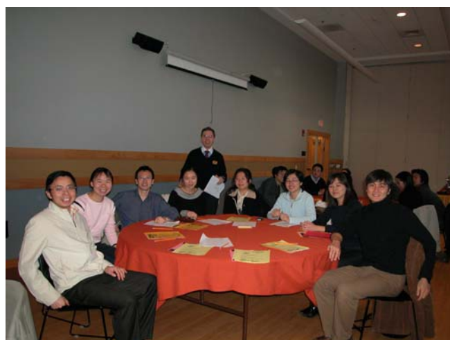
Staff and students enjoy the Traditional Thanksgiving Town Meeting.